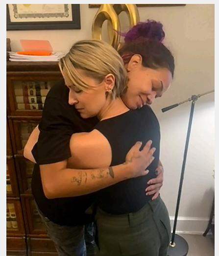
Bio Mom & Adoptive Mom